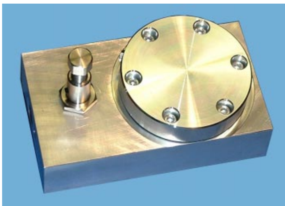
Gas dose module GDM1: Dosing and control valve with pressure compensated output.